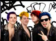
Single By Sunday (Glasgow)