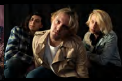
The Living Strange (Brooklyn)